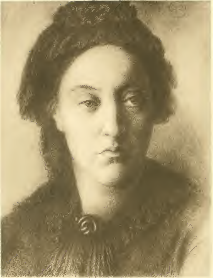
Christina Georgina Rossetti from a tinted-crayon drawing by Dante Rossetti 1877.